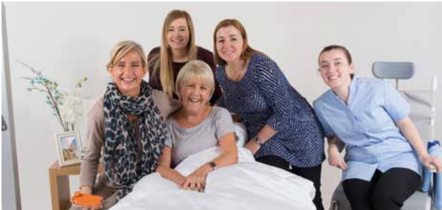
On location at the Hayes Studio in Penarth, Cardiff